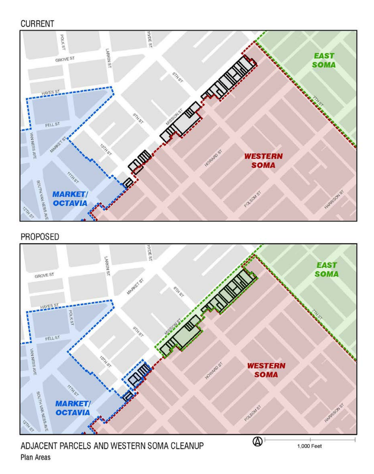
Figure 2 – Allocation of Adjacent Parcels into East SoMa Plan and the Market and Octavia Neighborhood Plan