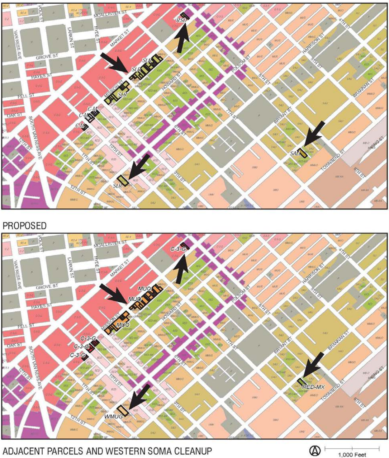
Figure 1 – Proposed Rezoning of Adjacent Parcels, Rezoning of Additional Adjacent Parcels and Cleanup Rezoning of Erroneously Zoned Parcels