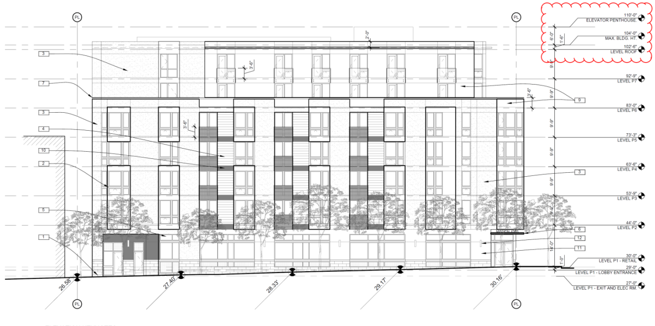
Figure 10. Proposed Project South Van Ness Elevation (West Elevation)