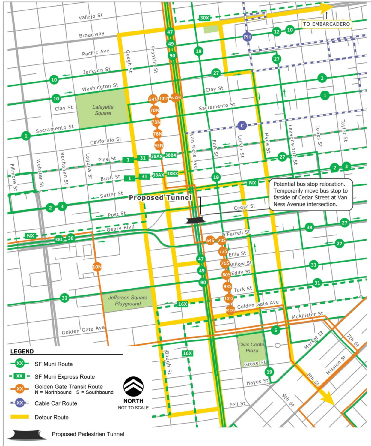
Figure 3 – Transit Routes in Project Area