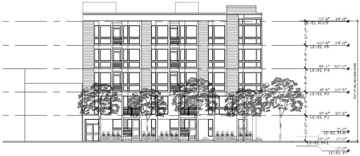
15TH STREET ELEVATION \frac{3}{32}'' : 1'0''