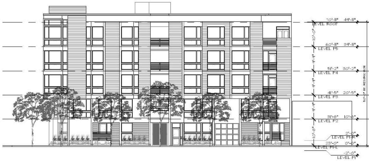
SHOTWELL STREET ELEVATION