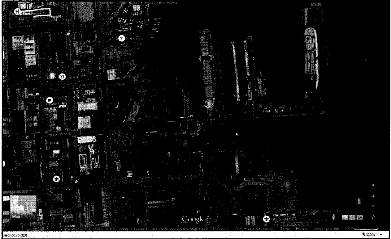
Aerial View, Pier 70