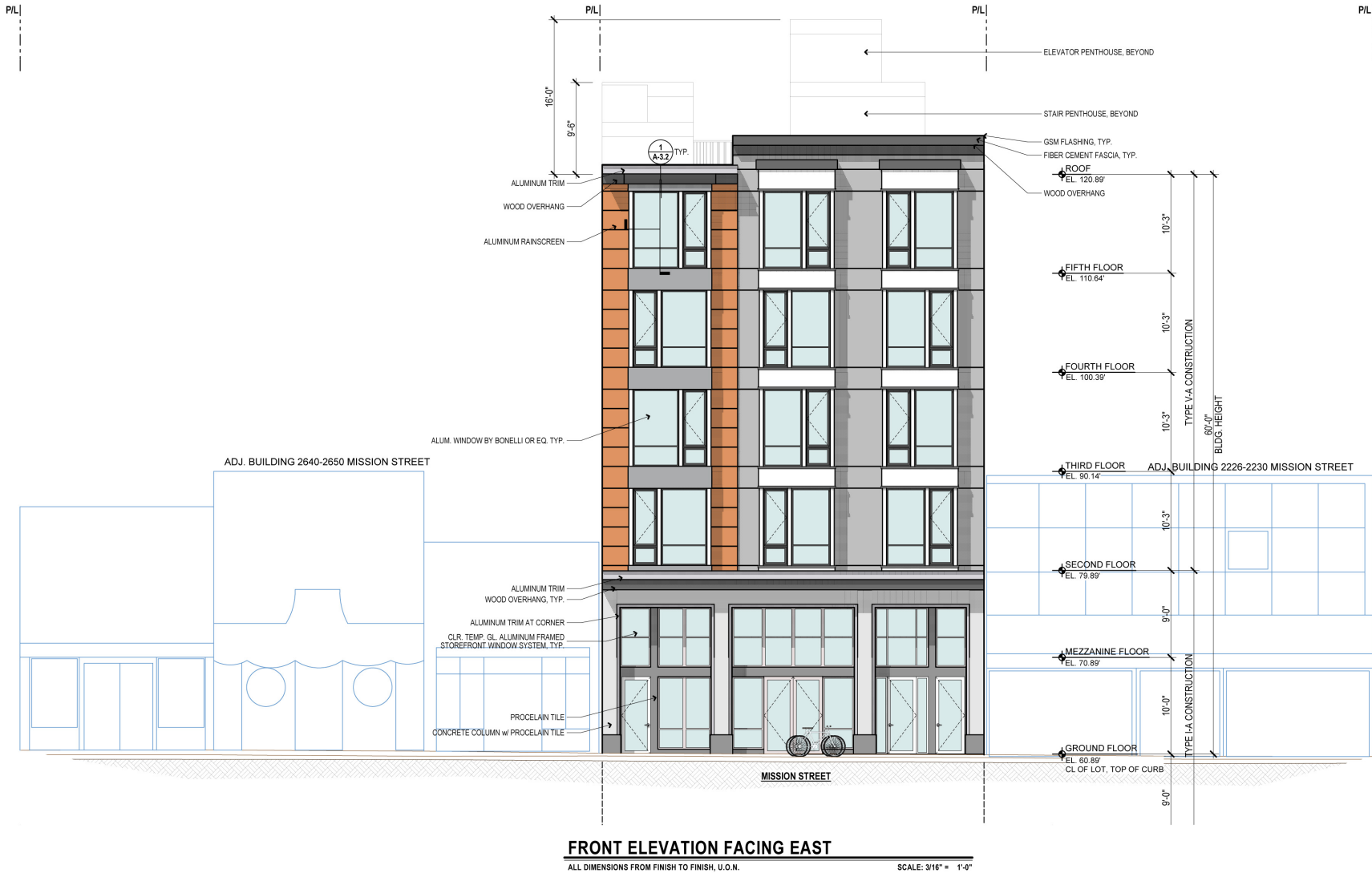
Figure 8. Proposed East Elevation (Mission Street)

Comments: Not to Scale Gabriel Ng Architects, March 9, 2017