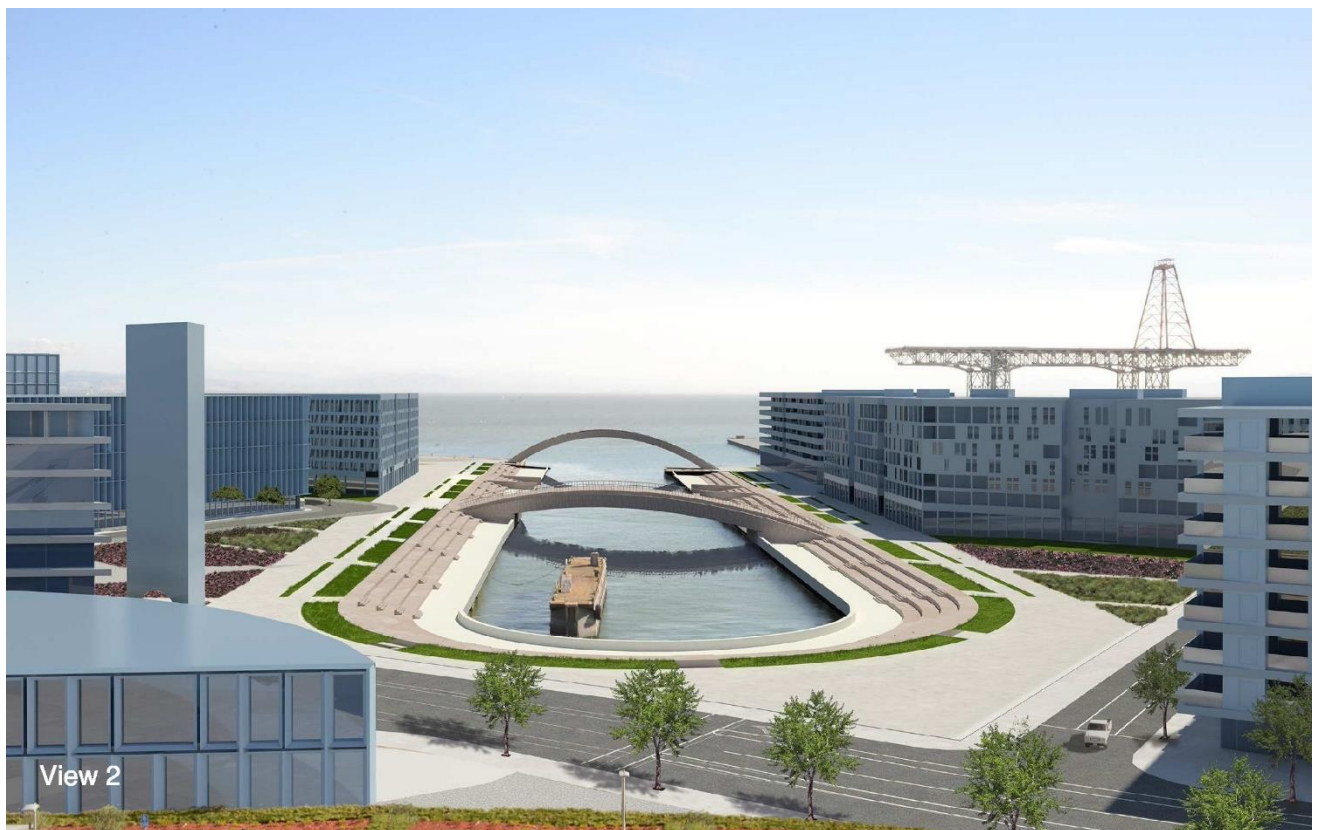
View 2: Proposed. [The bridges and seating plan are illustrative only (for environmental review purposes). No final designs have been prepared.]