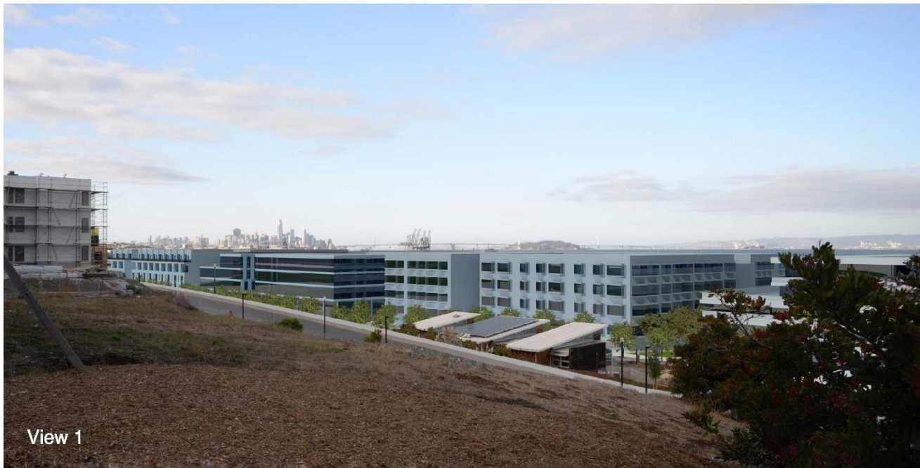
View 1: Proposed