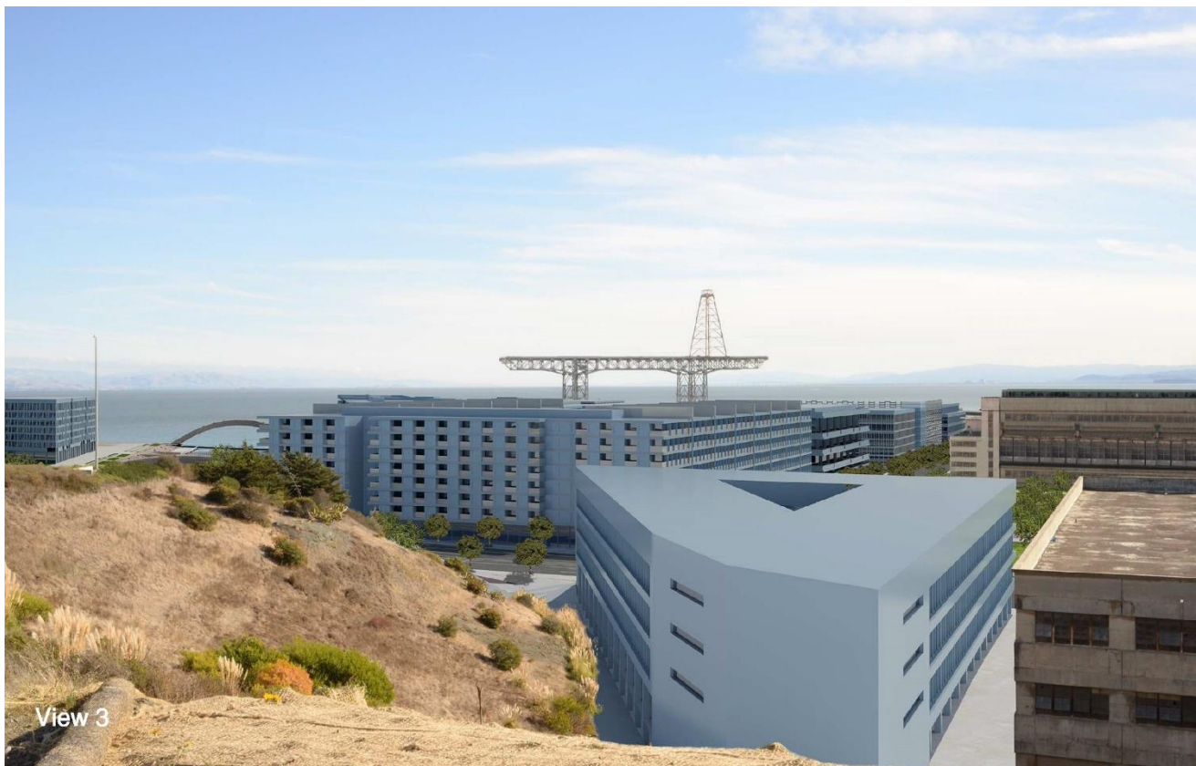
View 3: Proposed