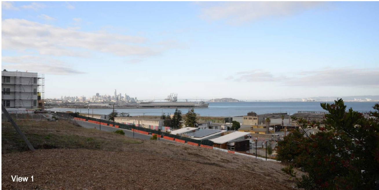
View 1: Existing