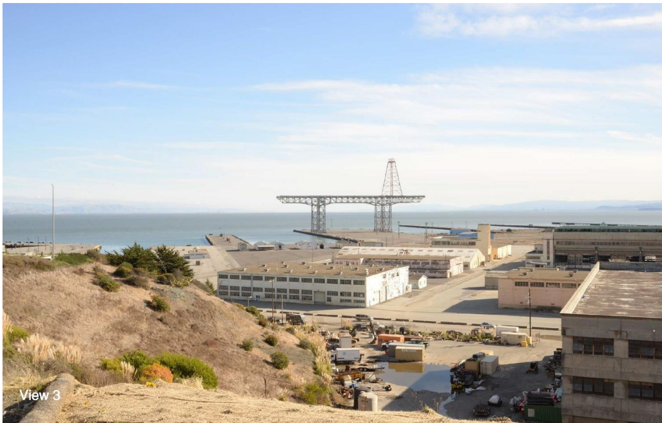
View 3: Existing